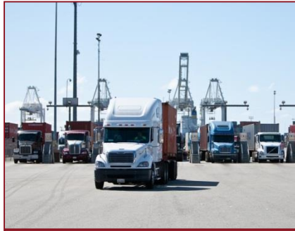
GATE OUT FULL