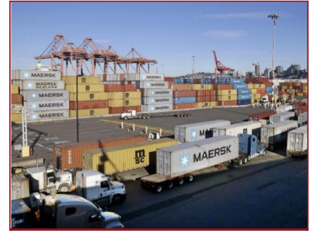
GATE IN EMPTY